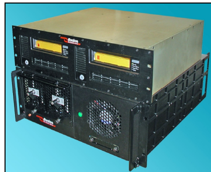
AE2604 Disk Crate Reader.

The Disk Crate Reader Model AE2604 is an inexpensive Windows-based unit that offers a convenient means of extracting digital data from the AE8400 Disk Crate direct to local or networked storage devices. For maximum transfer speeds, the PCI-X-based server is able to write to a 400 GB LTO-3 tape cartridge at up to 79 MB/s and to faster devices (e.g. RAID5) at up to 300 MB/s.